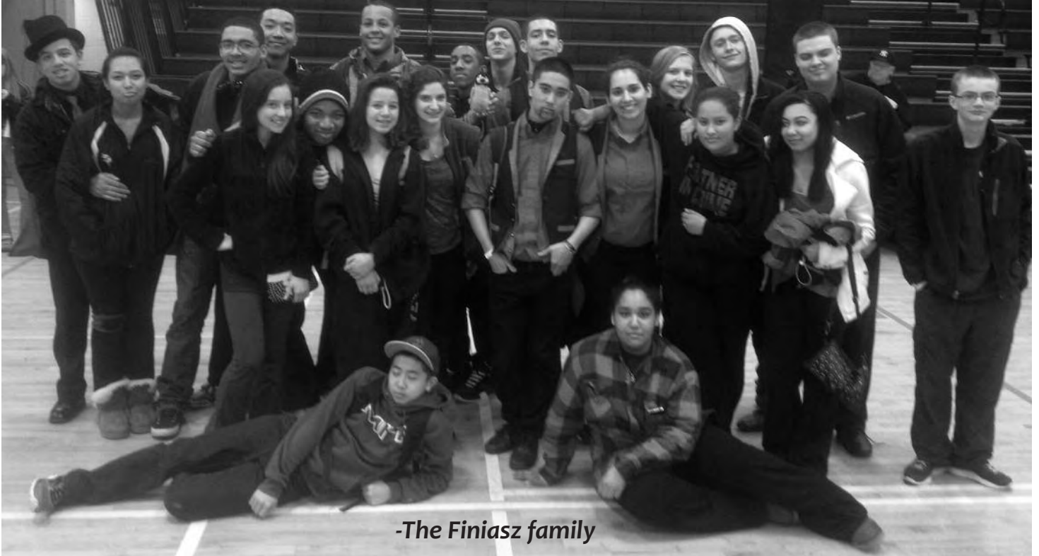
-The Finiasz family

Good luck to an amazing, dedicated, and hard working group of kids!